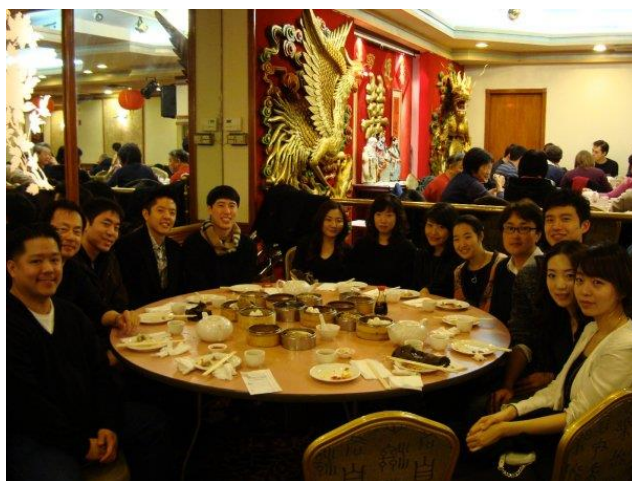
At the time...2010 BU/Tufts School of Dental Medicine Meeting